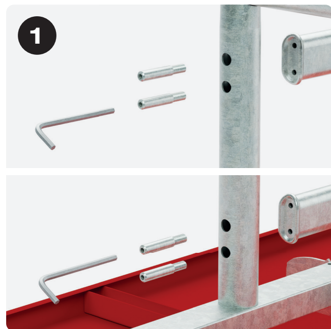
Screw both feet to the connecting strut.