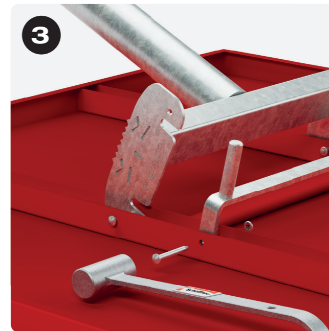
Place the two clamping brackets between the struts and secure on both sides with a notched nail and a notched nail holder.