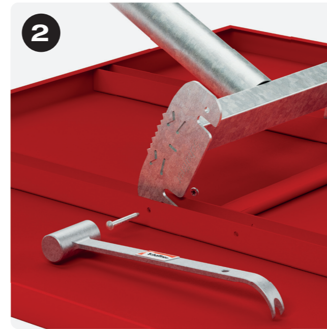
Place the pedestal on the table top so that the pedestal supports are positioned between the struts. Then, secure in place on both sides with a notched nail and a notched nail holder.